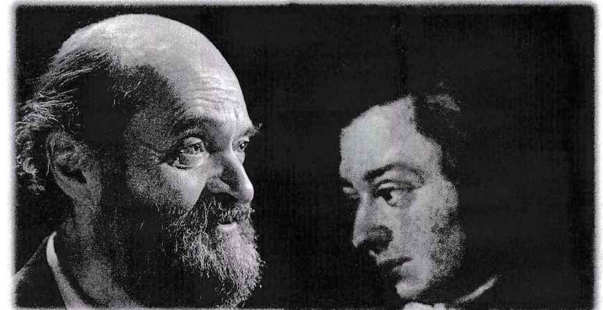
Pärt and Mozart (Pärt is the one with the clean-shaven forehead)

Mozart-Adagio is an exceptional composition among Pärt's work, with most of its material being in fact a musical quotation. The composition is based on the second movement of the Piano Sonata in F major, KV 280 (189e), which is heard here in its entirety, without missing a note. Pärt has complemented Mozart's musical speech using delicate and sometimes even unnoticeable comments, adding a few notes here and there and dividing the initial material between three instruments in a trio setting. With these subtle emphases he has given a tragic undertone to Mozart's wistful and inward-looking work.