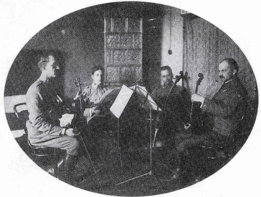
Webern, with cello, in war-time string quartet