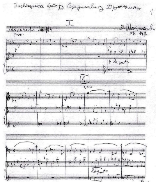
The beginning of Shostakovich's last work, in his own hand.